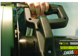
Ergonomic pull down handle