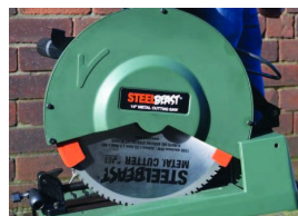
Portable, ideal to carry on site