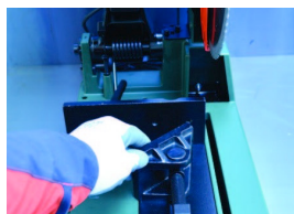
Quick acting vice handle clip