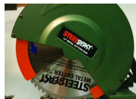
Retracting lower safety guard