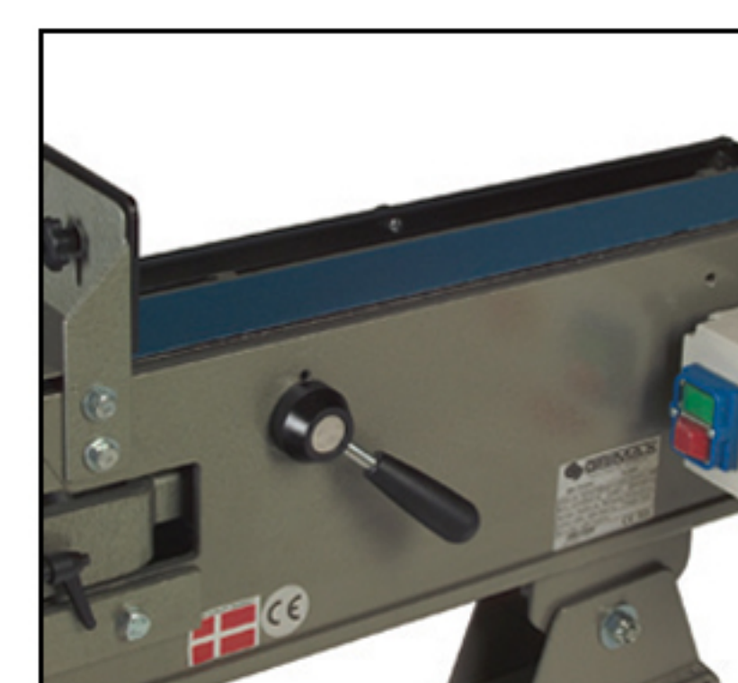
TOP GRINDING SURFACE