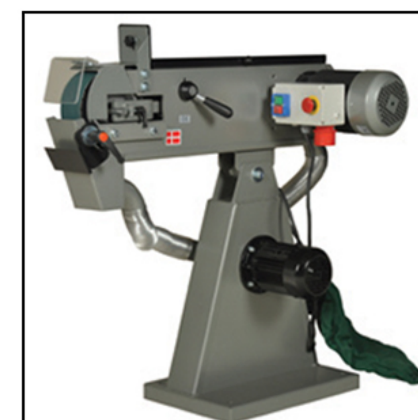
JEIBG-75X WITH EXTRACTION