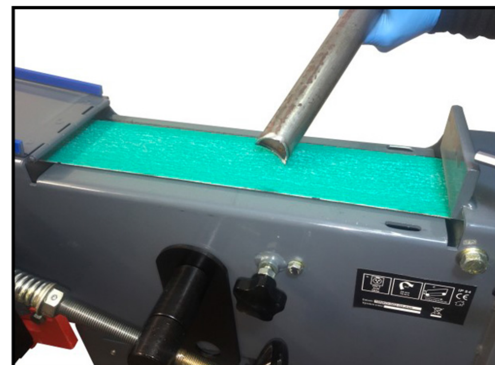
TOP SURFACE FOR DEBURRING

CALL 01706 229 490 TO BOOK YOUR DEMONSTRATION NOW OR VISIT WWW.STEELBEAST.CO.UK