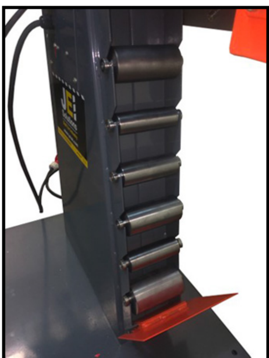
STORAGE RACK FOR UP TO 8 ROLLERS