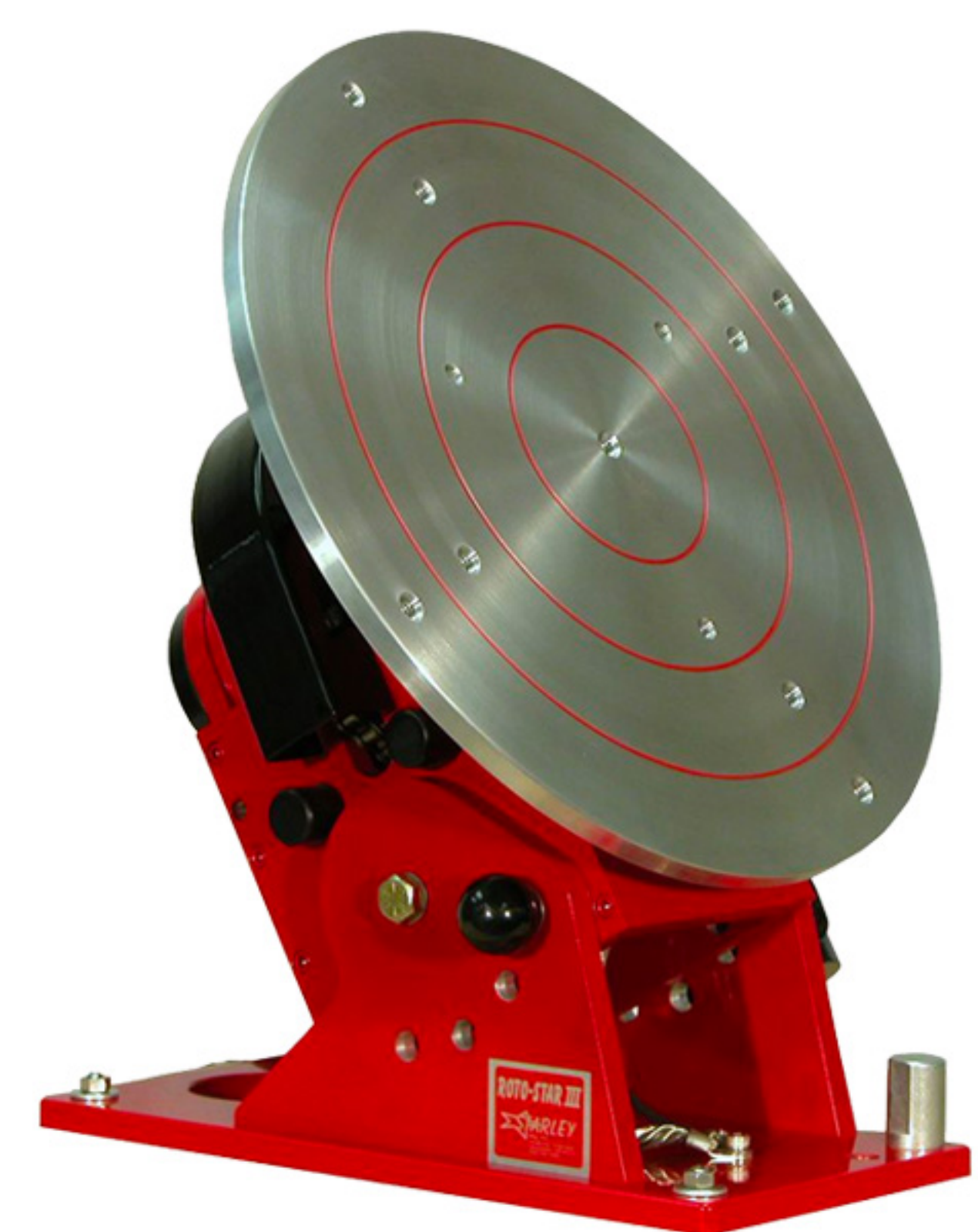
ROTO-STAR III WITH SURFACE PLATE

All models shown are for welding positioners only, please do not hesitate to contact a member of our sales team for information for use as a turn-table as it requires a specialist motor.