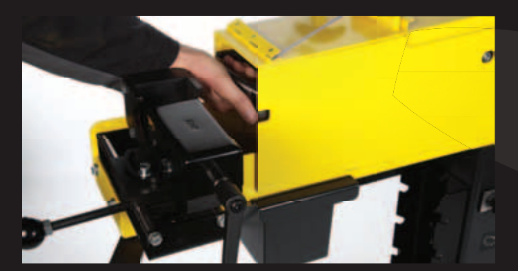
Grinding rollers can be changed without tools.

The innovative ALMI pipe grinders (except the HSX) can also be used as a belt grinder. The machine's operating mode can be changed with the flip of a switch.