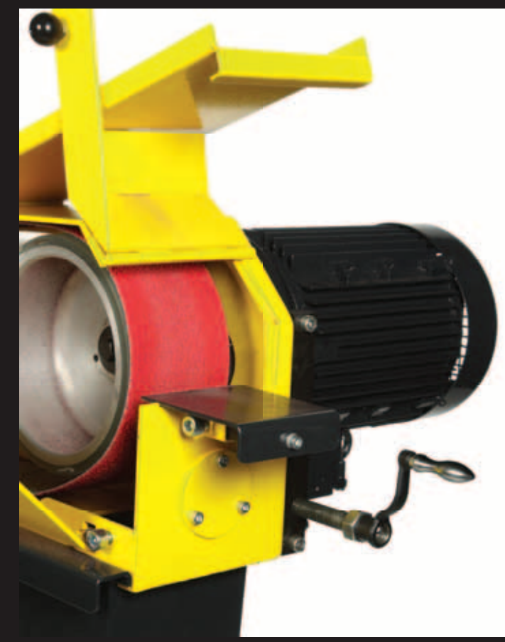
Pipe grinder and belt grinder in one

Enhance the quality of your welded structures through proper preparation. Milling pipes is expensive and time-consuming, but cutting translates into shorter preparation times and lower production costs. The ALMI pipe grinder can cut square, rectangular and round pipes with different wall thicknesses and is suitable for all common types of materials.